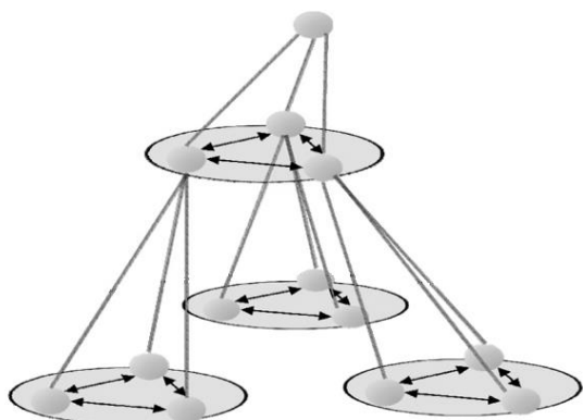
Fig. 1. Organization of holons in a holarchy with lateral and vertical interaction schema

is an autonomous actor with its defined principles and goals. However, its goals and strategies are also restricted by its head. The head of each holon manages inter-holon activities and represents the holon to the agent society.